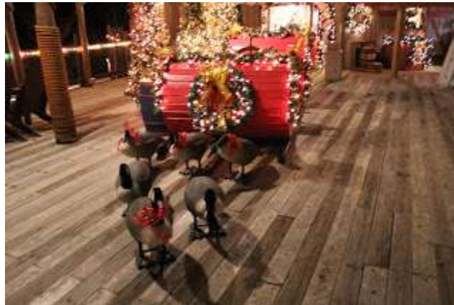
Christmas Sleigh at the Branson Belle Landing

The last three days were mostly driving on the bus with stops at Drury Inns in Terre Haute, Indiana and Troy, Michigan. At the Michigan Hotel we ran into a whole bunch of people who were staying at the hotel and were planing their Black Friday attacks on the consumer world. They were just a bit weird! We had dinner at noon at a Cracker Barrel. We had the turkey dinner special and we therefore had our second thanksgiving day! Turkey, ham dressing, gravy, cranberry sauce, green beans, sweet potato casserole, and biscuits.