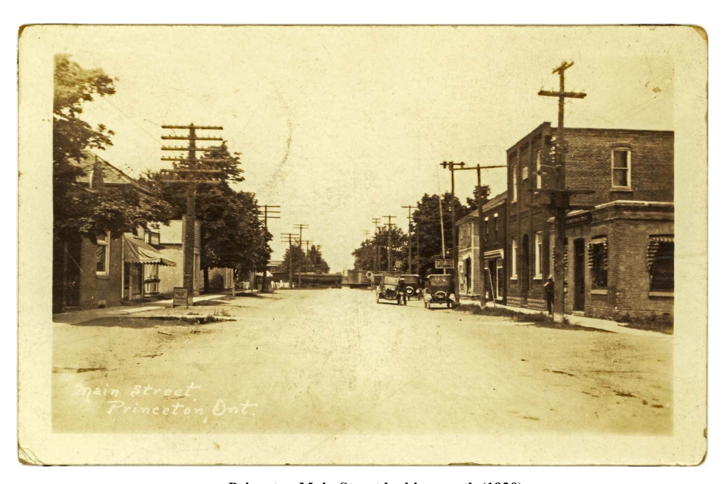
Princeton Main Street looking north (1920)